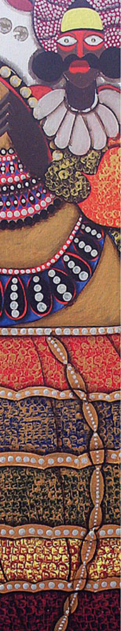
36 X 36 ACRYLIC