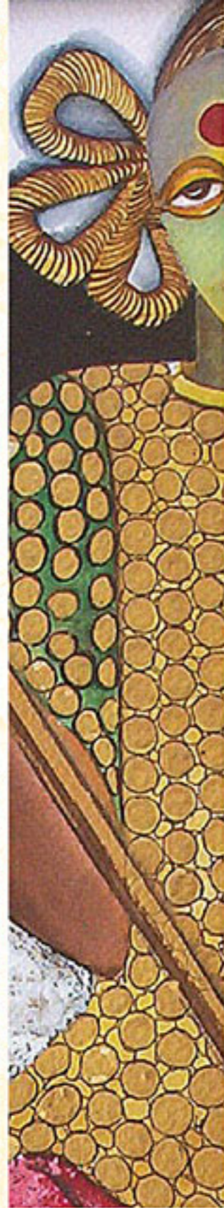
22 X 15 MIXED MEDIA