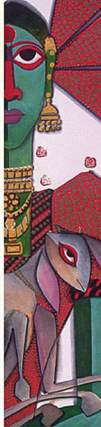
22 X 28 MIXED MEDIA