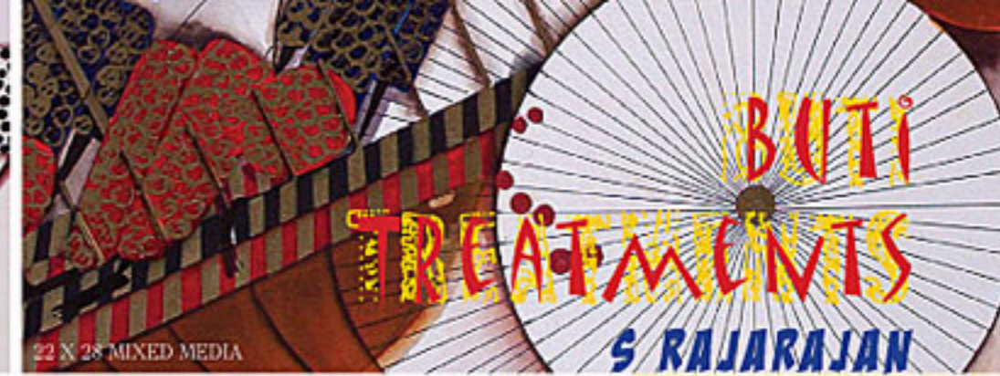
22 X 28 MIXED MEDIA