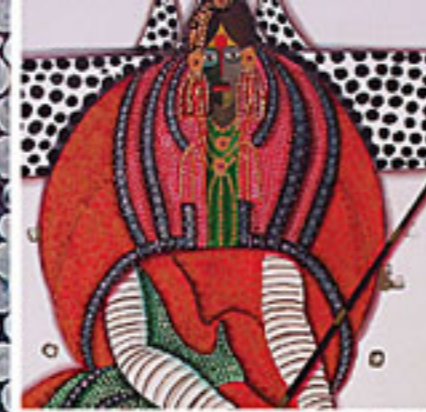
22 X 28 MIXED MEDIA