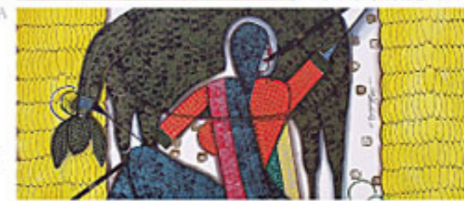
22 X 28 MIXED MEDIA